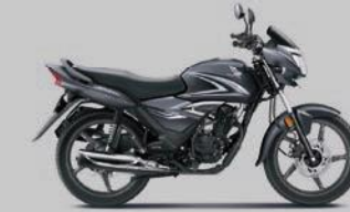
MATTE AXIS GREY