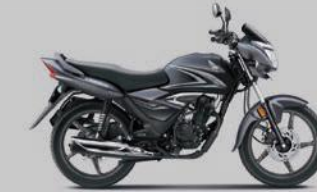
GENY GREY METALLIC